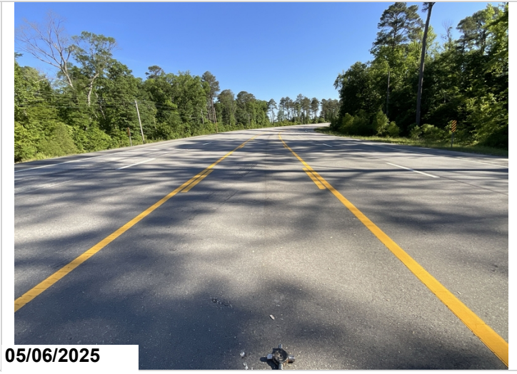
Roadway view - missing log mile signs

Asset #M1490 (Routine) US 425-01 LM 4.42 over Ditch - Ashley County Location: 4.42 Mi N LA Line-Hamburg Team Lead: Phillip Dowell Inspection Date: 05/05/2025