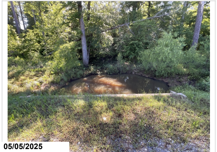
Channel - Right side view