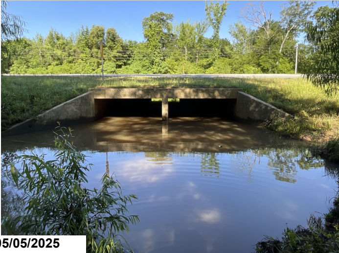
Elevation - Right side view