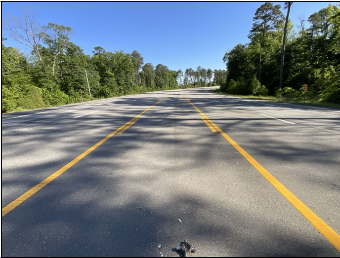
Roadway view - missing log mile signs