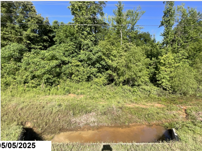
Channel - Left side view